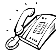
Church Office Hours

All articles for the June Newsletter are due on Monday, May 21, 2007.